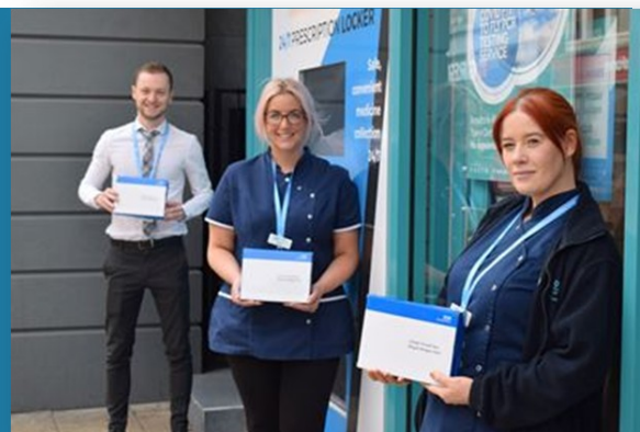
The Dear's Pharmacy Team (Dunfermline)

Testing is a crucial part of slowing the spread of the virus, helping to identify those carrying COVID-19 and preventing the virus from being spread to others. Around one in three people who become infected with COVID-19 may not feel unwell, but can still spread the virus without knowing it. If people test positive and self isolate, it helps stop the virus spreading.