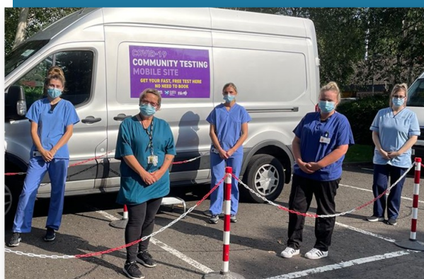
NHS Fife's COVID Testing Team

Colleagues in health and social care and those in certain workplaces regularly take part in home testing. Earlier this year the Scottish Government introduced free home test kits for everyone , with access to kits available free of charge from more than 90 collection sites across Fife – including testing sites and community pharmacies. Patients can find their nearest collection at: https://maps.test-and-trace.nhs.uk/ , or can order directly to their homes by visiting: www.gov.uk/order-coronavirus-rapid-lateral-flow-tests .