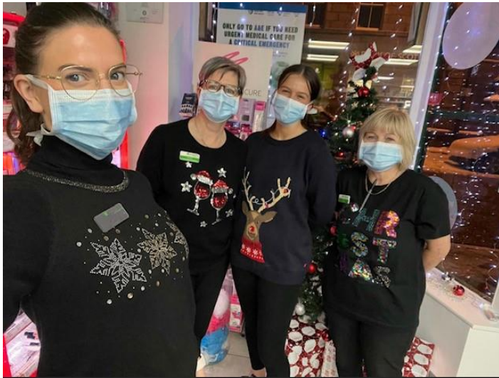
Staff at Davidsons Ballater wearing their Christmas Jumpers! Great effort!

Millions of people up and down the country were coming together at their workplace, school or with friends to raise money for the Save the Children charity. Did your pharmacy take part? Please send us photos of your staff with their festive jumpers on and we will share in next week's update! Save the Children is a great cause who back charitable causes across the UK and abroad. If you would like to donate see link here