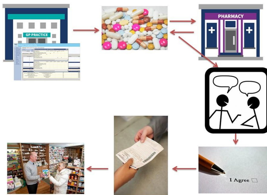
Figure 2: Serial prescription process