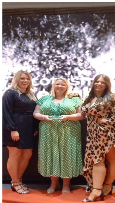
FIGURE 1: STAFF MEMBERS FROM BUCHANHAVEN PHARMACY WITH THEIR AWARD

crowned winners. Congratulations all, we hope you enjoyed your night!